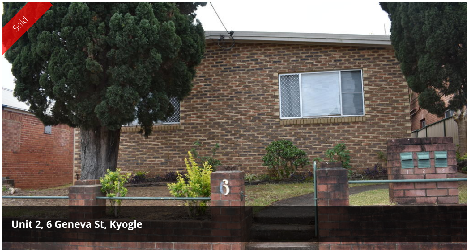
Unit 2, 6 Geneva St, Kyogle